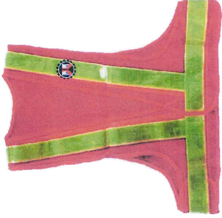
Neon Orange Reflectorized Vest