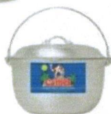
US-1 24 x 13cm