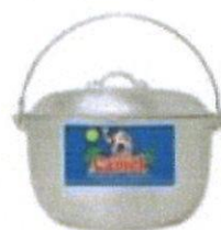
US-3 20.5 x 11.5cm