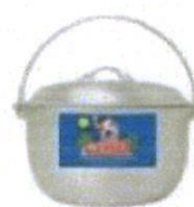
US-5 17 x 10cm