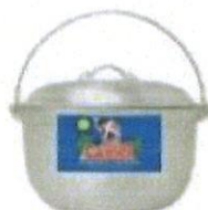
US-4 19 x 11cm