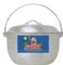
US-2 22.5 x 13cm