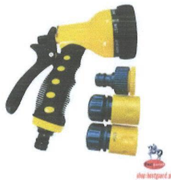
HOSE NOZZLE SET, PLASTIC, ADJUSTABLE