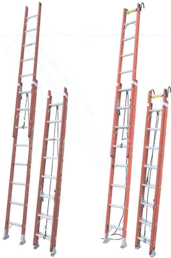
FIBER GLASS EXTENTION LADDER, 30FEET