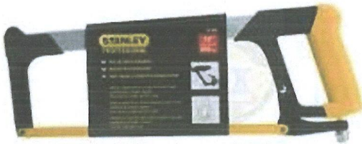
HACKSAW 300mm, 24TPI