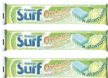
SURF DETERGENT BAR KALAMANSI 360g x 3 bars